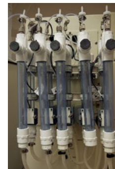
Wastewater 2-Stream and 5-Stream Option